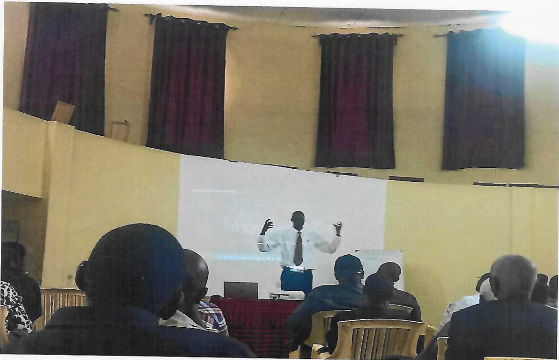
1: Municipal Manager addressing the citizens and facilitating the Q&A session