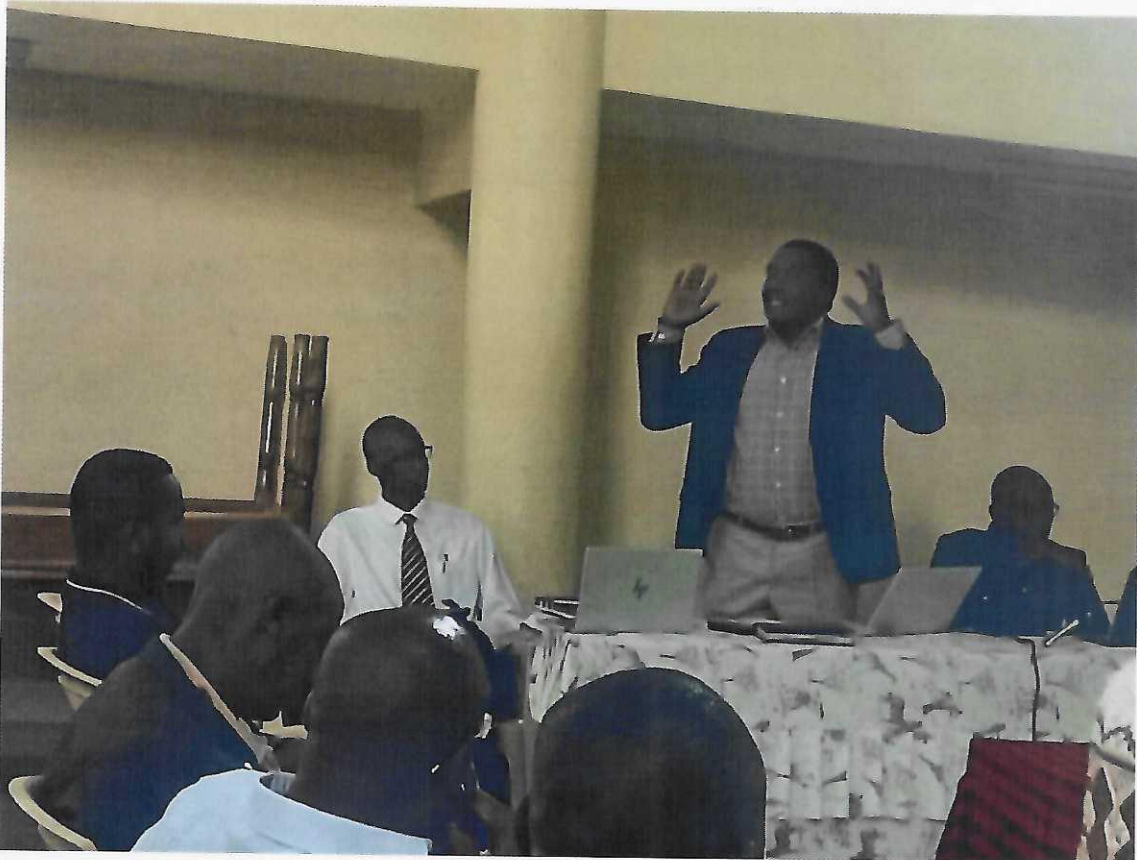
Figure 2: The Chair K-CARA addressing the citizens on the importance of Residents' Associations