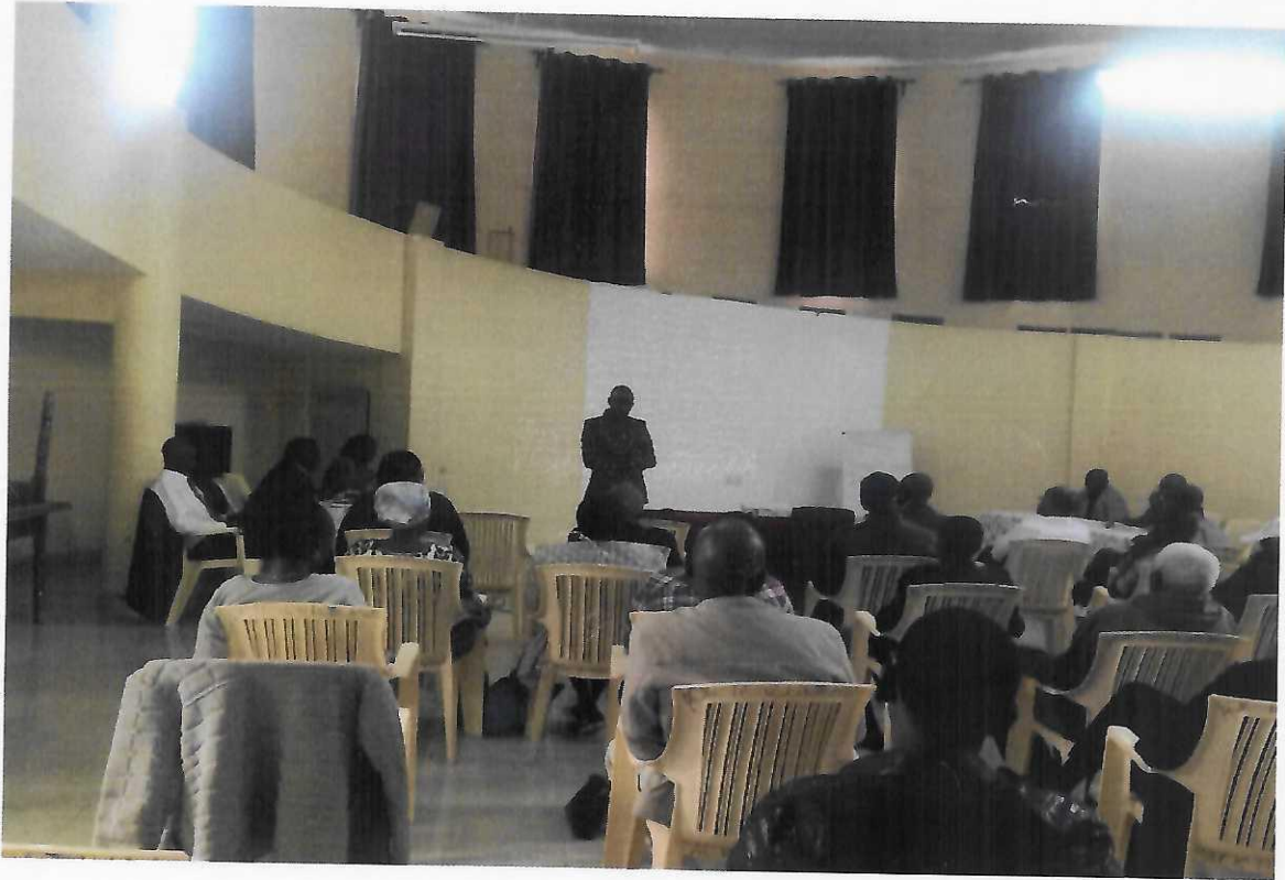
Figure 6: Vice-Chair K-CARA addressing the citizens and responding to the questions regarding Residents Associations