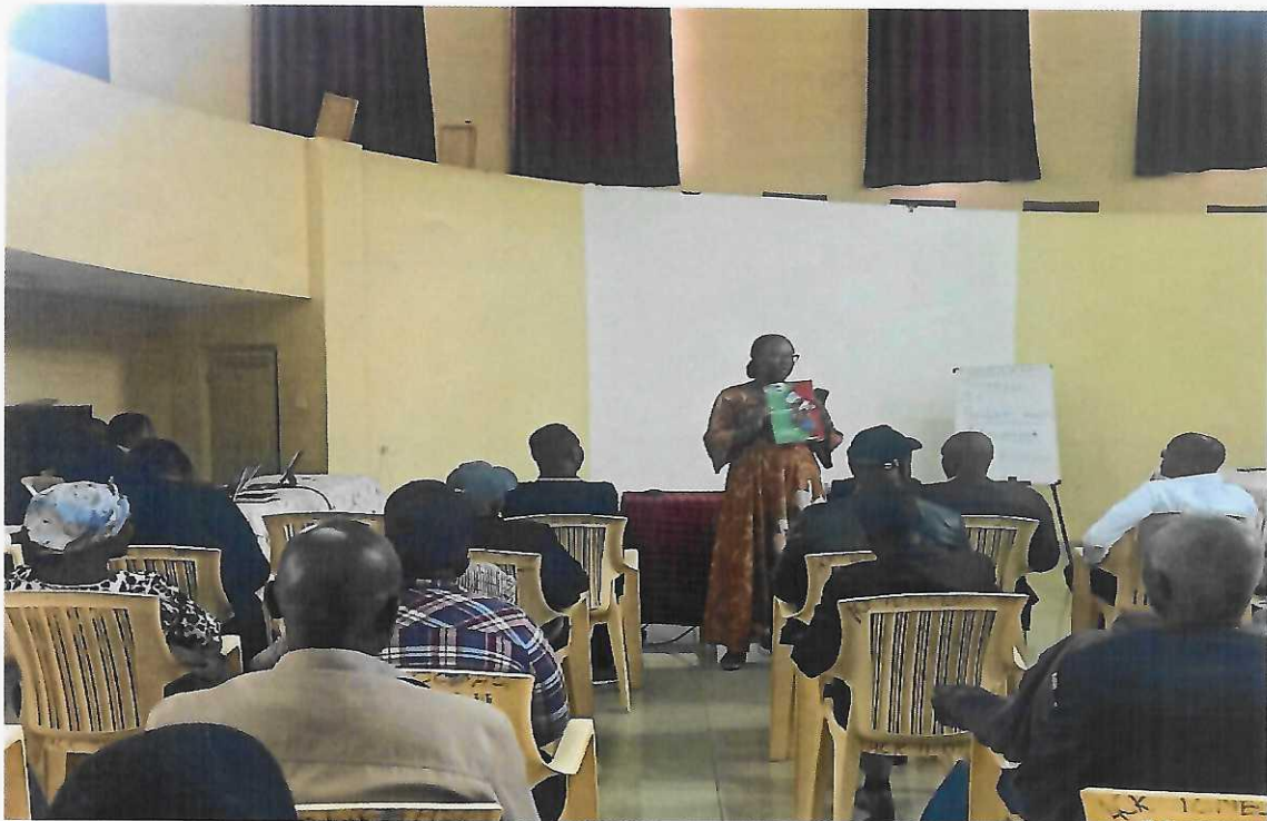
Figure 4: Secretary K-CARA Administration and strategy holding MoE