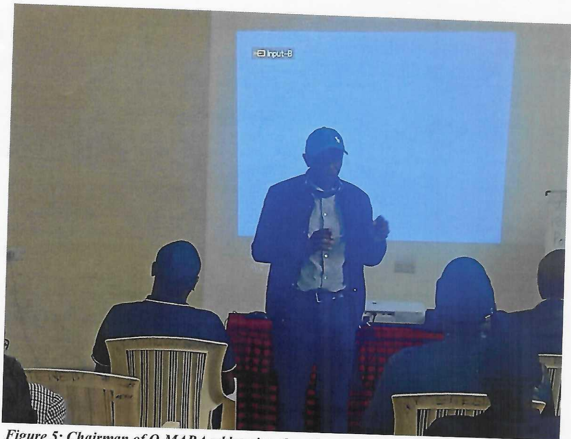
Figure 5: Chairman of O-MARA addressing the citizens