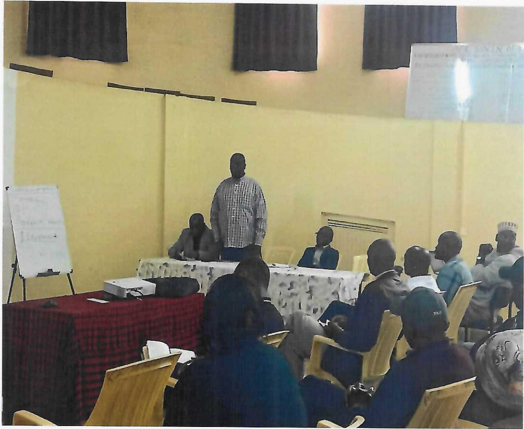
Figure 3: Citizen Fora Chairman addressing the Citizens