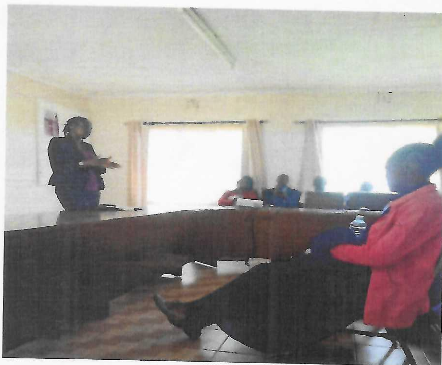
Kajiado Central Public Health Officer addressing the Citizens