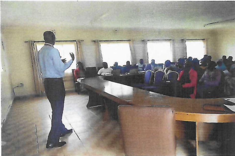
The Municipal Manager addressing Kajiado Municipality Residents