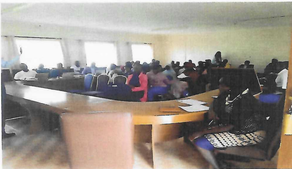
Members present at the Citizen Fora